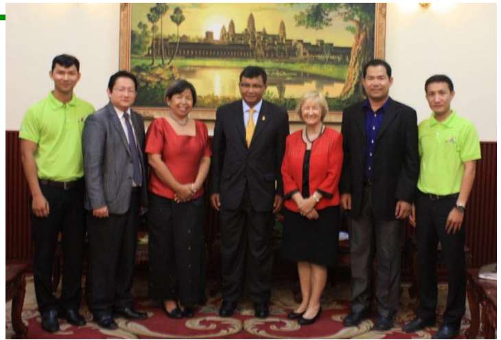
Youth Star with H.E. Dr. Hang Chuon Naron

We are grateful to the Ministry of Education, Youth and Sport for the cooperation and support, which enable Youth Star's programme to help both our young volunteers and marginalized rural communities.