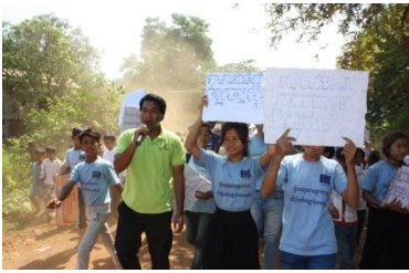
Children are listening to the speech

Women's Affairs, local authorities, teachers and parents participated and presided over the event.