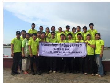
Alumni post a picture after the semi-annual meeting

Youth Star Cambodia Alumni was officially established in 2008. A management committee was organised and a charter and by-laws for governing the association were agreed. Annually, the committee sets priority actions for promoting volunteering in Cambodia and for supporting Youth Star. The Alumni is a membership association for former volunteers and staff of Youth Star Cambodia. It offers an opportunity to these former volunteers and staff to remain a part of the Youth Star family and to continue to contribute to furthering the mission and vision of Youth Star. Former volunteers elected by their peers manage the Alumni Association. Today, the alumni have around 200 members, and this number is increasing every year. Recently, the alumni have restructured its managing body through an election. On 27 th June, the team held a half-yearly meeting to reflect the work and set new priorities for the coming months.