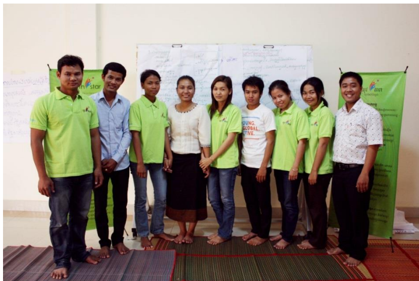
Youth Star volunteer Group 18B undergo pre-departure training in January 2014