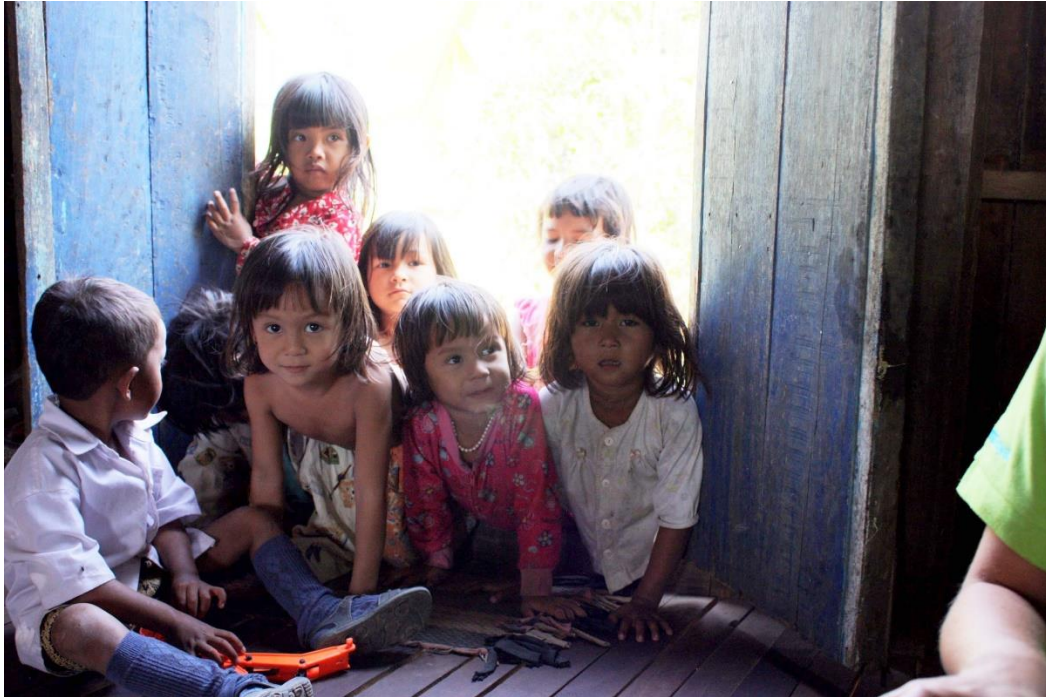
Kampong Thnal children eager to learn

A requirement of fundraising through Globalgiving is that regular progress reports are to be posted on its website detailing how the funds raised are being used to achieve the project's objectives. Four project reports were posted on the Globalgiving website during 2014. These reports were: