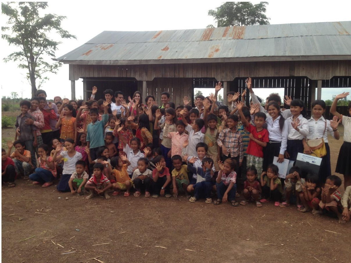
Children's club in Chang Krang village

Through their civic service in 2014 our volunteers provided substantial benefits to children and young people in the communities where they worked. They served as important role models to children and youth in these communities and through establishing local youth clubs they provided a framework and strategies for village youth to engage in community self-help activities.